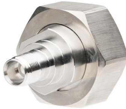
NEX10 Female to 7/16 DIN Male