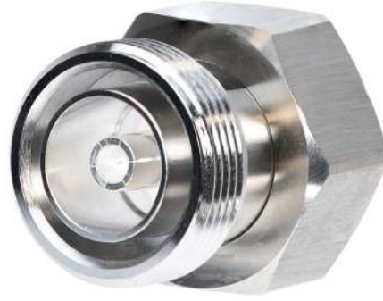
7/16 DIN Male to 7/16 DIN Female