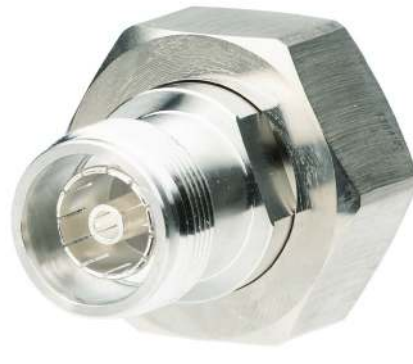
4.3-10 Female to 7/16 DIN Male