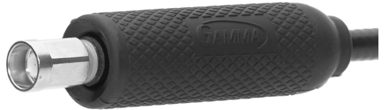
Installed on NEX10®

The NEX10 & F Connector Boot is manufactured from a highly UV resistant silicone rubber that protects and seals connections. The silicone rubber is rated to operate in extreme temperatures from -76° (F) up to well over 400° (F), (or a temperature range of -60° to 230° Celsius). The boot also protects connections against dust, fungus, corrosion and Ozone.