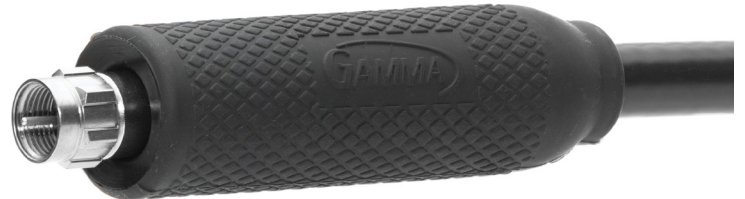
Installed on F Connector