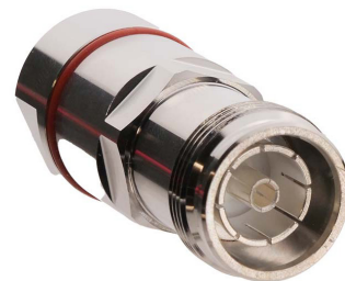
Female 4.3-10 Compression Connectors