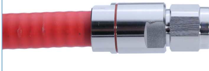
Fully Installed Connector on Gamma Electronics 1/2" Plenum Cable