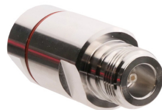
Female 4.3-10 Compression Connectors