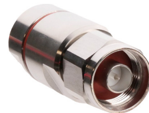
Male Type N Compression Connectors