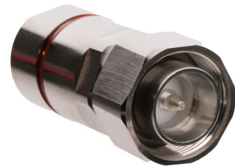
Male 4.3-10 Compression Connectors

*Gamma recommends a torque of 18 Newton-meters (160 in-lbs)